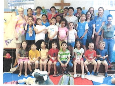
Deep Sea Discovery VBS July, 2016