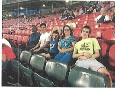
Our Trip to See the Brockton Rox July, 2016