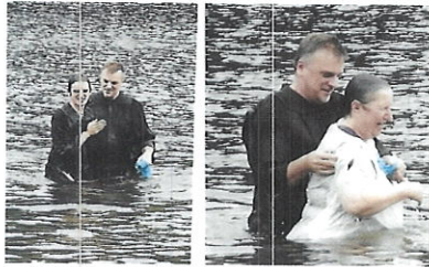
Baptism at Houghton's Pond August 6, 2016